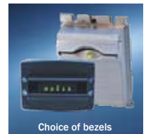
Choice of bezels